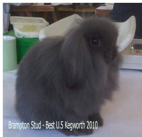
Best U/5 at Kegworth, a pretty blue Lion Lop of Brampton Stud