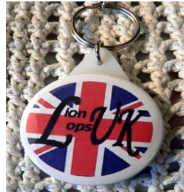
Two new products to support your Club, above a new key-ring @ £1.50 and below, a coat badge @ £1.00

Call at the website for up to date information www.lionlopsuk.co.uk