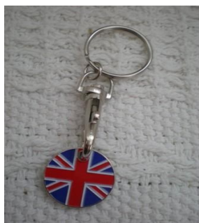
Token Key Ring £1 each